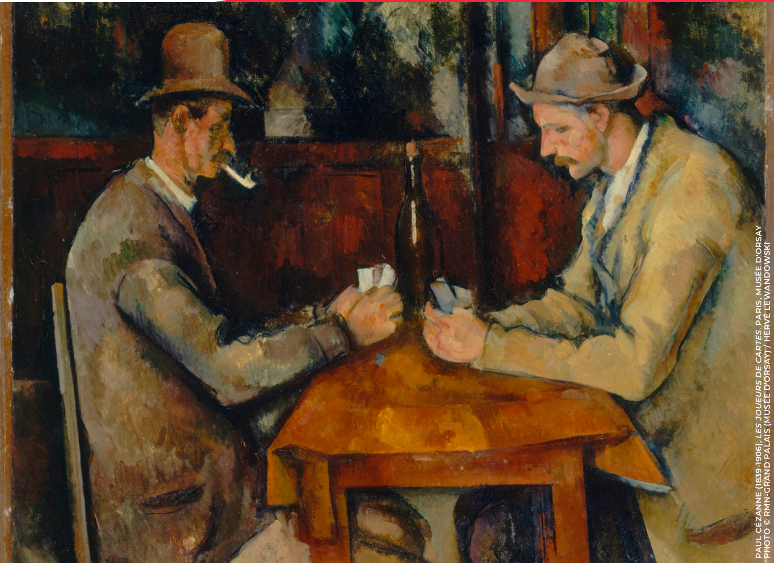
PAUL CÉZANNE (1839-1906), LES JOUEURS DE CARTES, PARIS, MUSÉE D'ORSAY