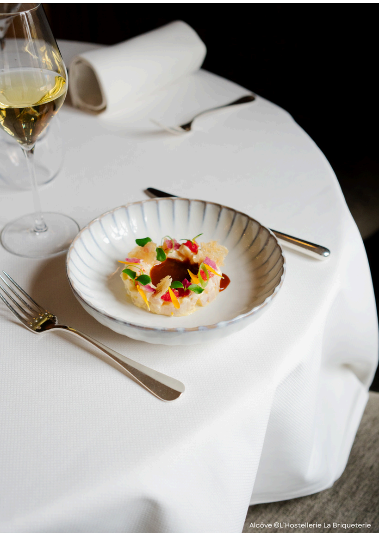
Alcôve