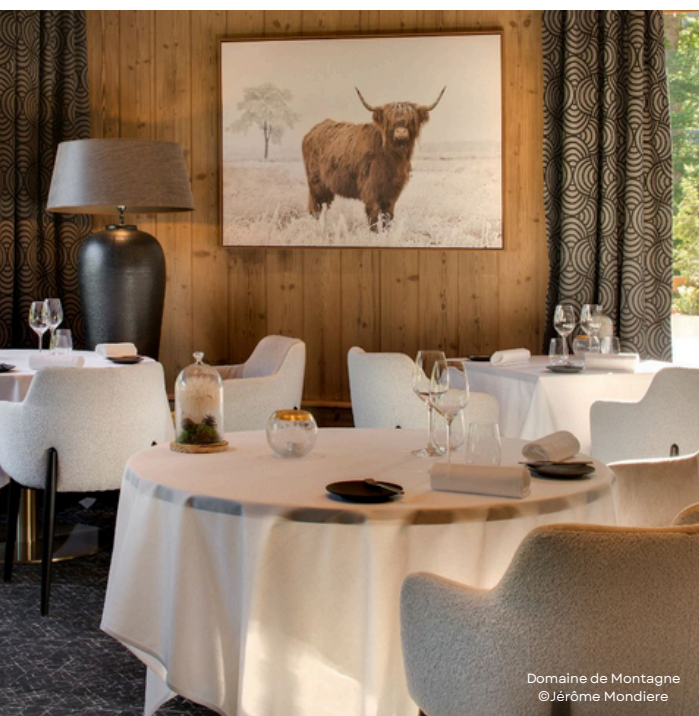
Domaine de Montagne