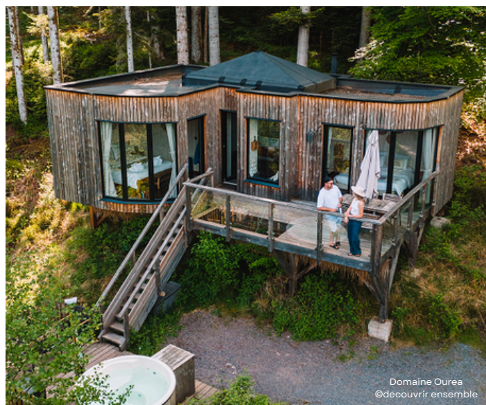
Domaine Ourea

First conceived in 2018 by Delphine and Jonathan Pitz, Domaine Ourea combines luxury with escapism and offers a true return to nature. Each of their three eco-lodges tells a different story and are designed and decorated to reflect different heritage from around the world. From their African lodge to the Japanese Ryokan, and the Finnish-inspired Kittilädome, all three lodges are built entirely from locally sourced materials and even come with eco-friendly outdoor hot tubs . Located in an enchanting pine forest, the Domaine allows for a more off-grid exploration of the fauna of the Vosges , by foot or on mountain bike, close to the pristine Lac de Pierre-Percée.