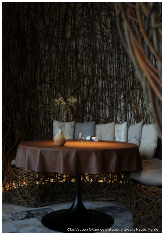
Clos Vauban