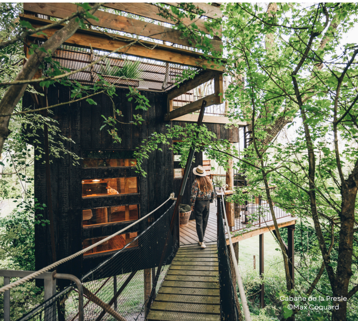
Cabane de la Presle