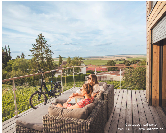
Cottage Antoinette

Nestled within the Montagne de Reims Regional Nature Park, Cottages Antoinette is a four-star luxury adults-only eco-retreat , designed for complete relaxation and immersion surrounded by nature. Comprised of three contemporary wooden cottages on stilts that offer panoramic views over the vineyards and the city of Reims , each cottage can accommodate up to four guests who can look forward to enjoying a half bottle of champagne upon arrival, while a jacuzzi awaits in the garden. As of 2026, breakfasts and electric bike hire are included in the price , while a fourth cottage and a new rooftop restaurant called La Vie en Roses are set to open later this year.